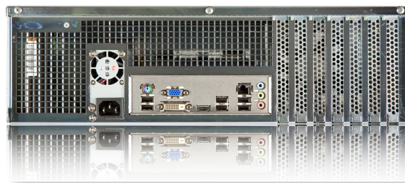
ECOserver EIB back