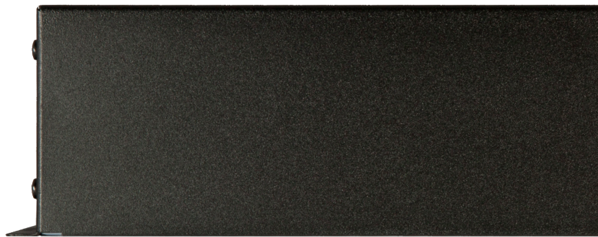
ECOserver model EEB frontview